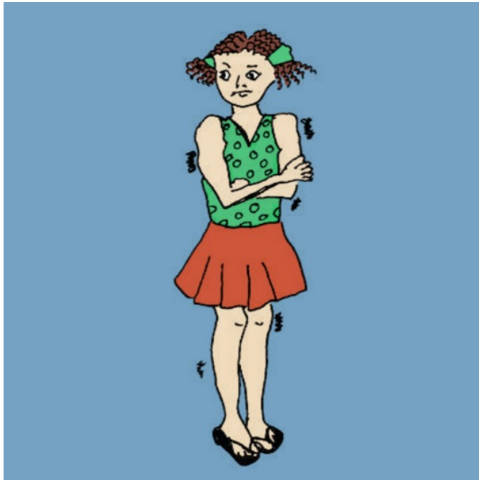
هَوا سَرَد اَست.