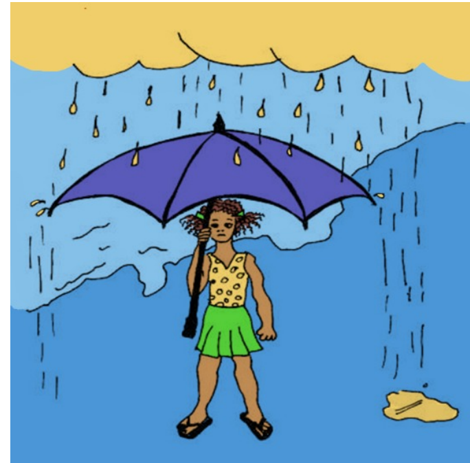
باران می بارَد.