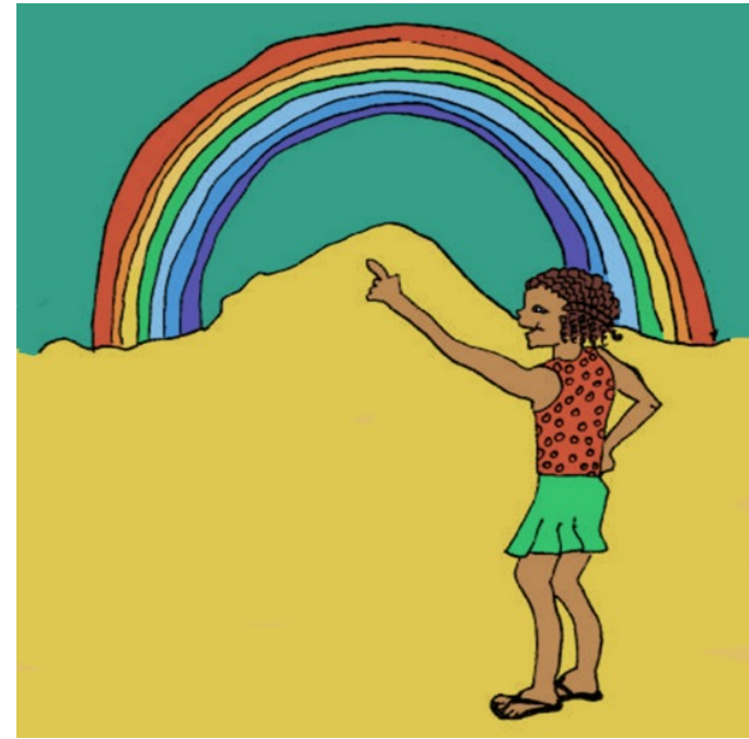
من یک رنگین کمان می بینم.