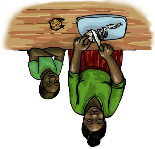
Mama yanggu anakatakata vitunguu.