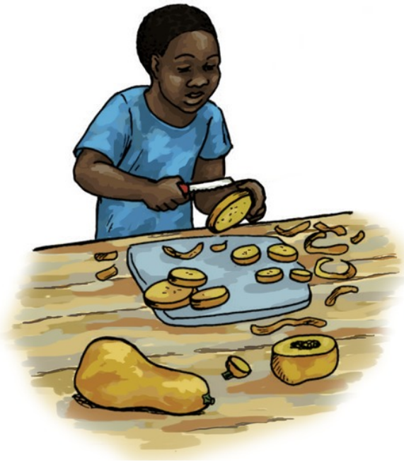
Ninakata mbegu za maboga.