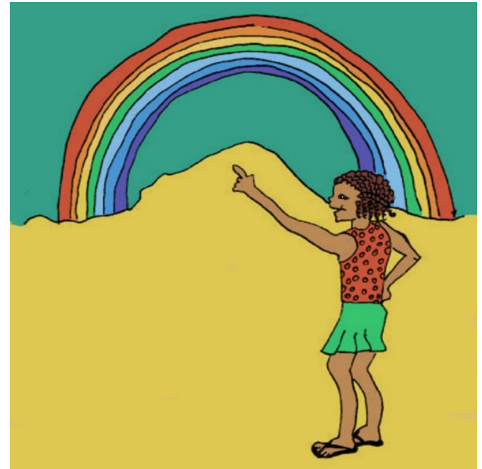
Naona upinde wa mvua.